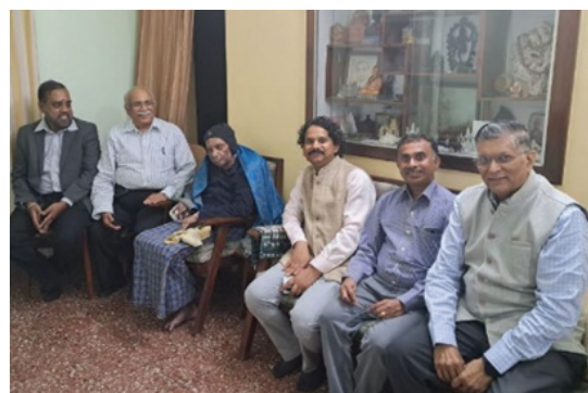
Honoring Justice (Retd) K S Puttaswamy An icon of privacy in India